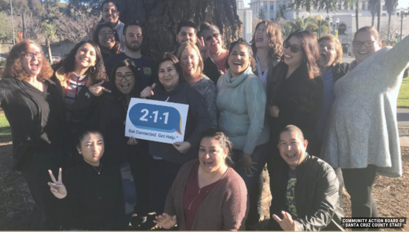
COMMUNITY ACTION BOARD OF SANTA CRUZ COUNTY STAFF